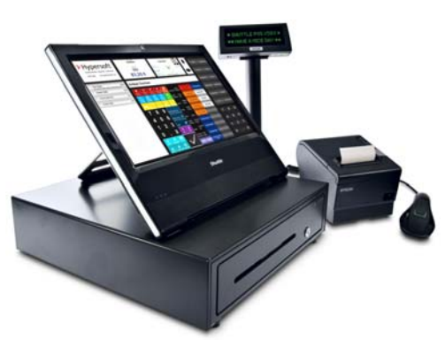
P.O.S. Point of sales