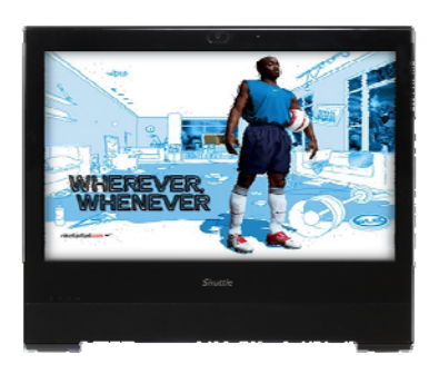
Digital Signage Visual advertising, entertainment, displaying information in public areas