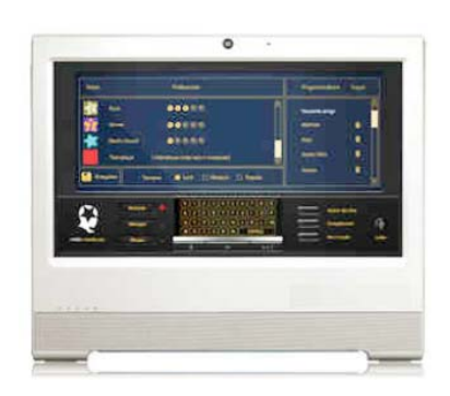
Instore Radio Playing advertising and music