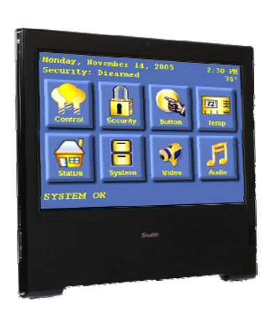
Control Surveillance, Home Automation, Control device