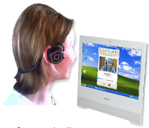
Communication Email, VoIP, Messenger, Blog, Video Conferencing