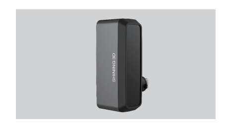
HD Prime Pack (Only for EinScan Pro 2X Plus) Allows markers free scanning under Handheld HD Scan mode to achieve fine detail 3D data when the object surface has enough geometries.