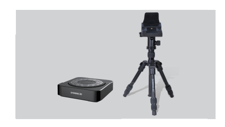
Industrial Pack (For EinScan Pro 2X & 2X Plus) Makes a static automatic scan on a tripod possible for a better accuracy.