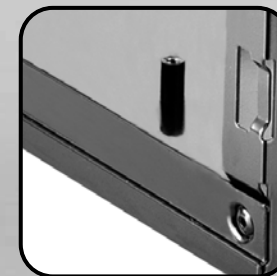
Elevated standoff for motherboard back side components