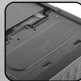
Support 2.5" and 3.5" hard drives