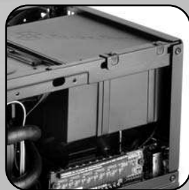
Mini-DTX / Mini-ITX motherboard & ATX PSU compatible