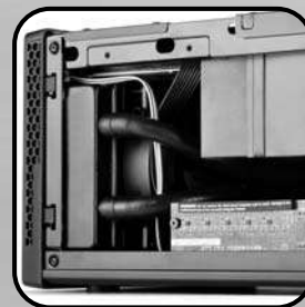
Support 120mm or 140mm single fan All-in-One Liquid Cooler