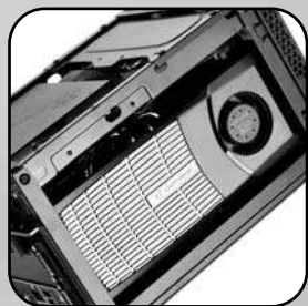
Support standard-length expansion cards (10.5 inches)