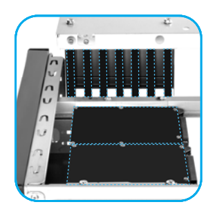
Amazing capacity for 2.5" drives