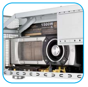
Support graphics cards of any length