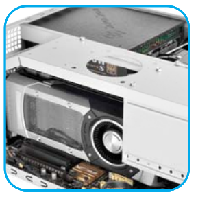
Micro ATX motherboard & ATX PSU compatible