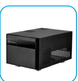
Cleanly styled SFF chassis with modernized layout