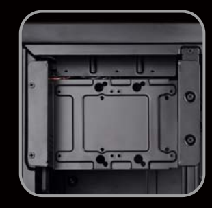
Drive cages with multi-purpose mounts eliminate need for adapters