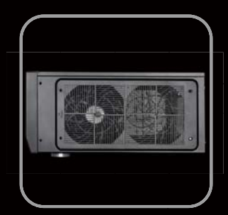
Positive air pressure design for excellent cooling/quietness and dust-prevention