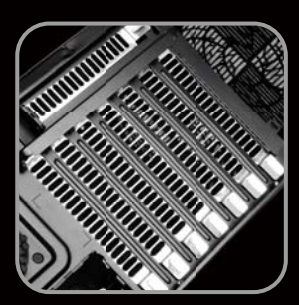
Support expansion cards up to 12.2 inches