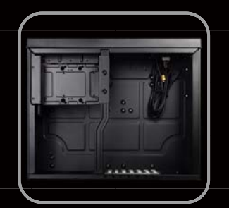
Support ATX motherboards