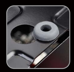
Anti-vibration design helps reduce noise