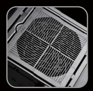
Quick access filters included