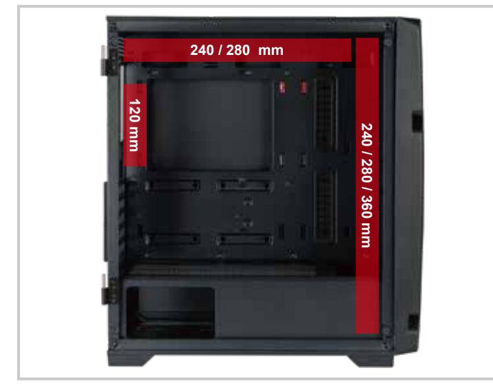
Support 360 AIO in 38mm Thickness