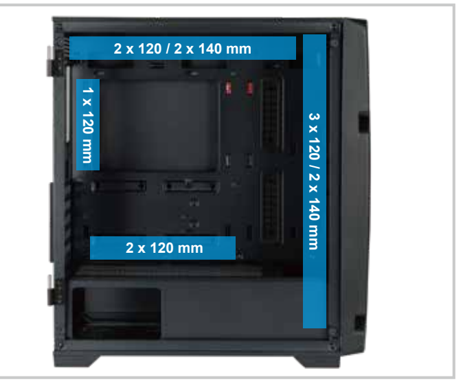
Maximum 8 Fans Installation