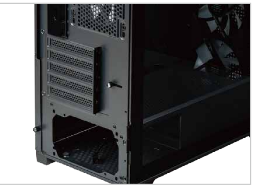
5 Reusable Expansion Slots

Magnetic Dust Filter on Both Top and Front Side