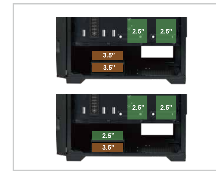
Support 2 x 3.5" and 3 x 2.5" (1 x Converted From 3.5" HDD Cage Drive Bay)