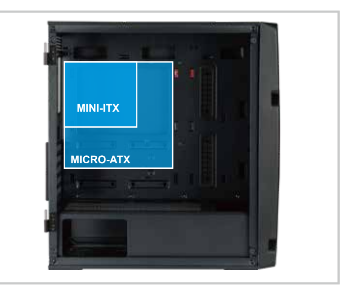
Mini ITX to Micro ATX Motherboard Compatibility