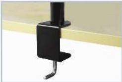
Desk Edge Mounting

Pole x 1 / Mounting Arm x 1 / Clamp x 1 / Hex Key x 2 / Cable Hook x 2 / Rubber Pad x 1 / Spacer x 4 / Cable Clip x 1 / Screw x 19 / Manual x 1