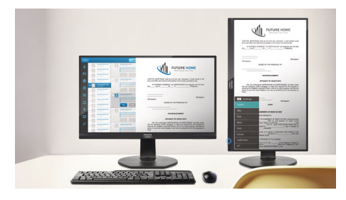
EasyRead mode for a paper-like reading experience