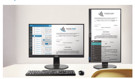
EasyRead mode for a paper-like reading experience