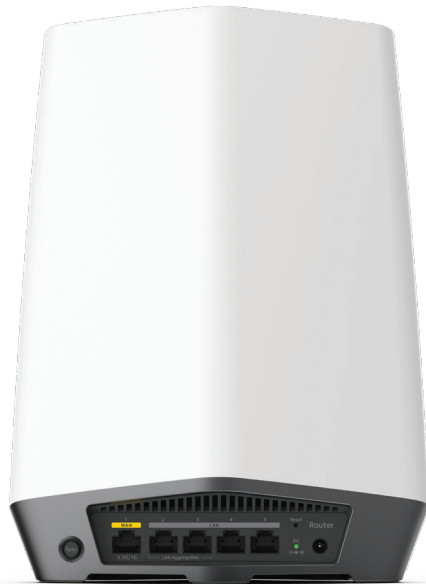
Orbi Pro WiFi 6 Router (SXR80)