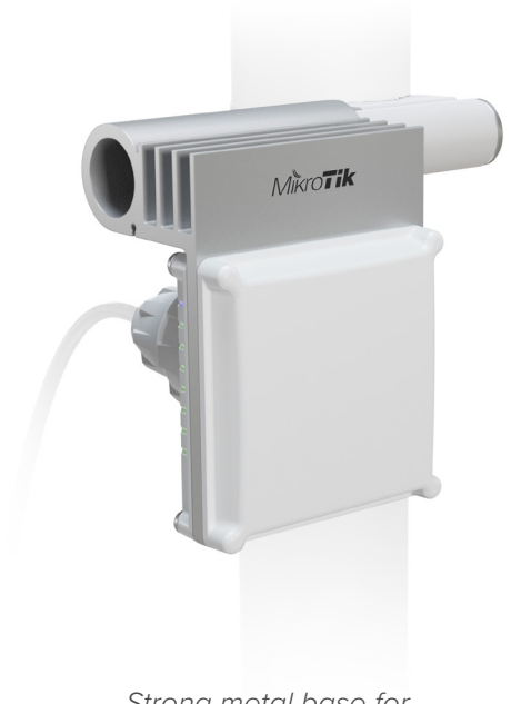
Strong metal base for improved cooling and

If you need to connect multiple devices — take a look at the CubeSA 60Pro ac sector antenna. Reaching distances around 600 meters in point-to-multipoint mode, this device can be very helpful for all kinds of event management: from live shows, festivals, and workshops to construction sites, pop-up vaccination clinics, and so on. No need for complex wired installations in every location — the portable and handy CubeSA 60Pro ac has got you covered! Depending on your setup, the distance can be even greater. For example, with devices like MikroTik nRAY, you can reach up to 800 meters.