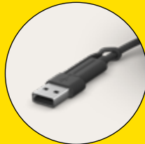
USB C and USB A connectors included