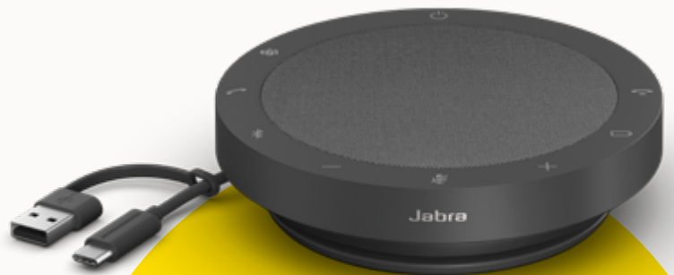
MS TEAMS & UC VARIANTS

We consider sustainability carefully at every stage of product development. The casing of Speak2 55 is made with over 50% sustainable materials**, and has a number of built-in parts that can be repaired or replaced. Better sustainability = longer speaker life = great calls for you and your team for years to come.