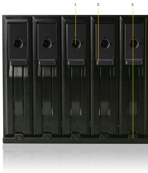
Front view IB-555SSK

Package Contents IB-555SSK 1x IB-565SSK, 5x SATA cables, 2x Keys, 8x Screws, 1x Manual