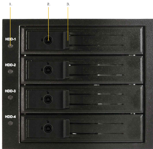
Front view IB-564SSK