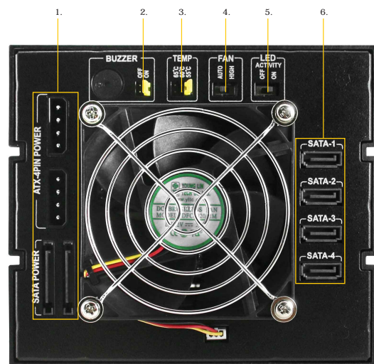
Rear view IB-564SSK