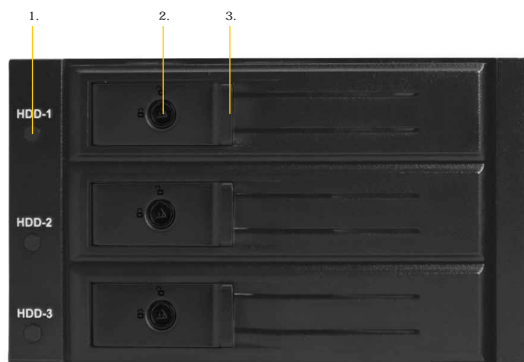
Front view IB-563SSK