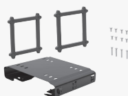
HP Desktop Mini v4+ VESA Sleeve

Wrap your HP Desktop Mini PC in the HP Desktop Mini v4+ VESA Sleeve to securely mount it—with or without an Expansion Module 1,2 —behind your display, position the solution on a wall, and lock it down with the integrated security bracket and optional HP Ultra-Slim Cable Lock.