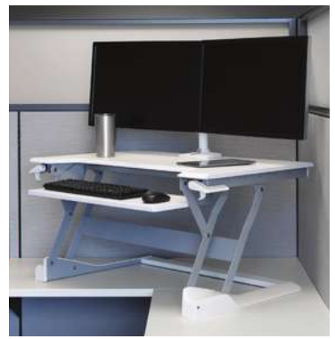
SHOWN WITH WORKFIT-TL SIT-STAND WORKSTATION

EACH MONITOR HAS INDIVIDUAL UP/DOWN TILT