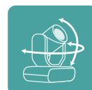
Wide Angle PTZ