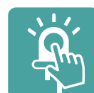
One-Button Fill Light