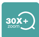
30X Optical Zoom