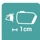
Short Working Distance