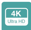
4K Output Resolution