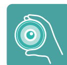
Handheld Camera Head